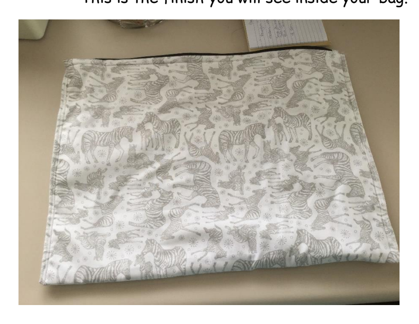
The only thing left to do is trim off the bottom corners then turn you bag through.

These are then neatened with your roller cutter and ruler then overlocked. This is the finish you will see inside your bag.