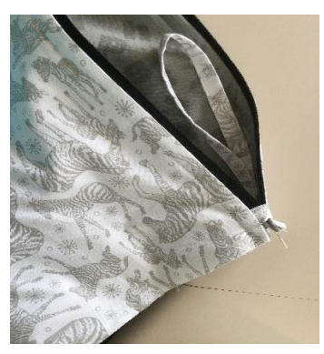
Open your zipper a few inches for easier turning Sew your two side seams from lining side

These are then neatened with your roller cutter and ruler then overlocked. This is the finish you will see inside your bag.