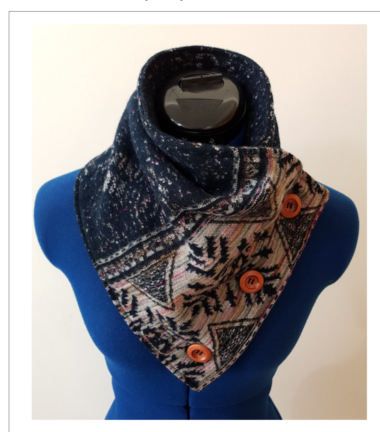
Created by Cathy <a href="http://www.picklecreations.co.uk/">http://www.picklecreations.co.uk/</a>