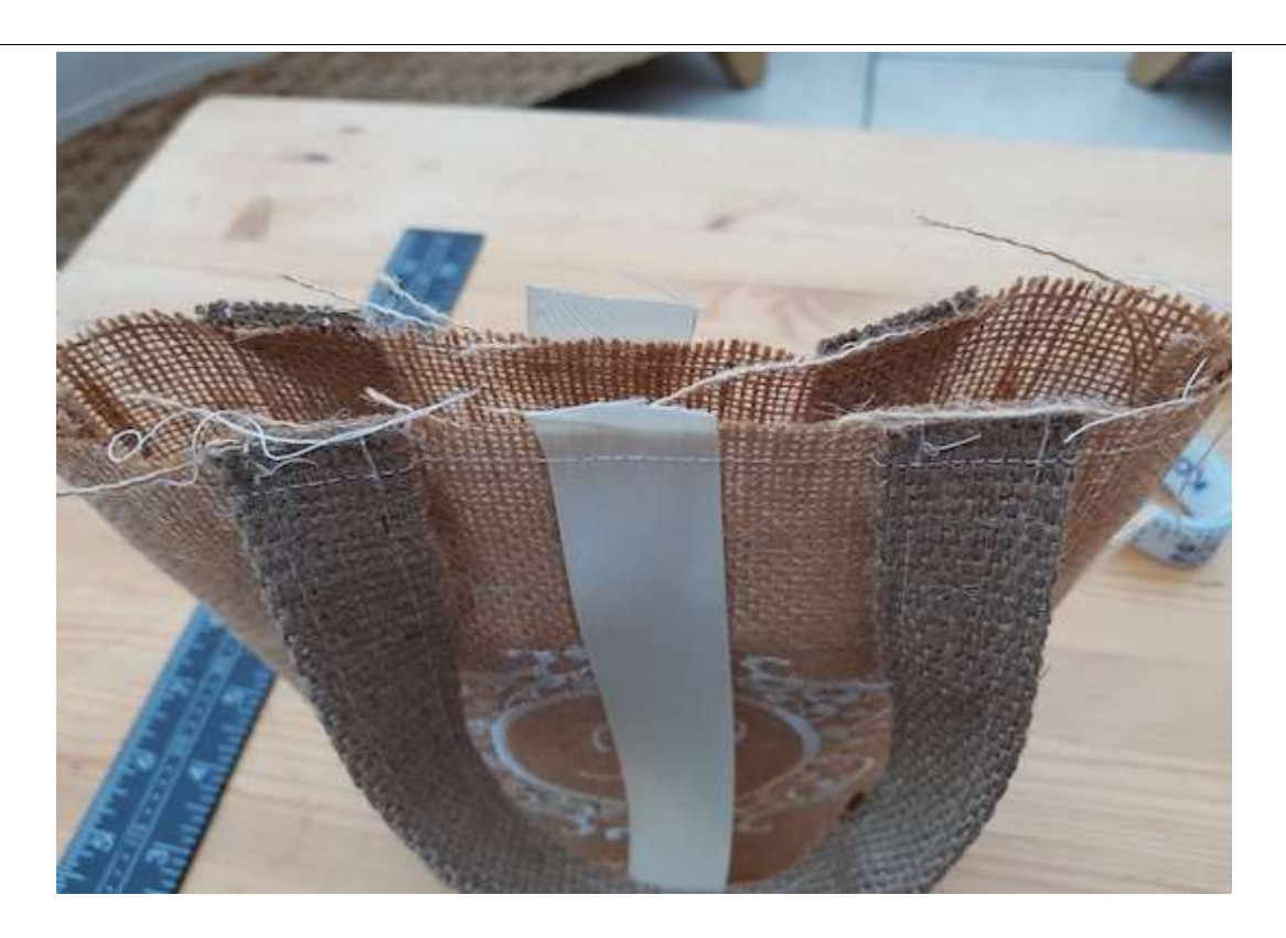
Secure the handles and ribbon in place with a 1/4" seam.