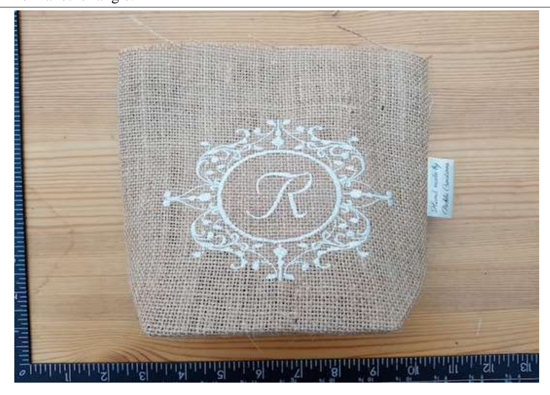
Turn right way out and press.