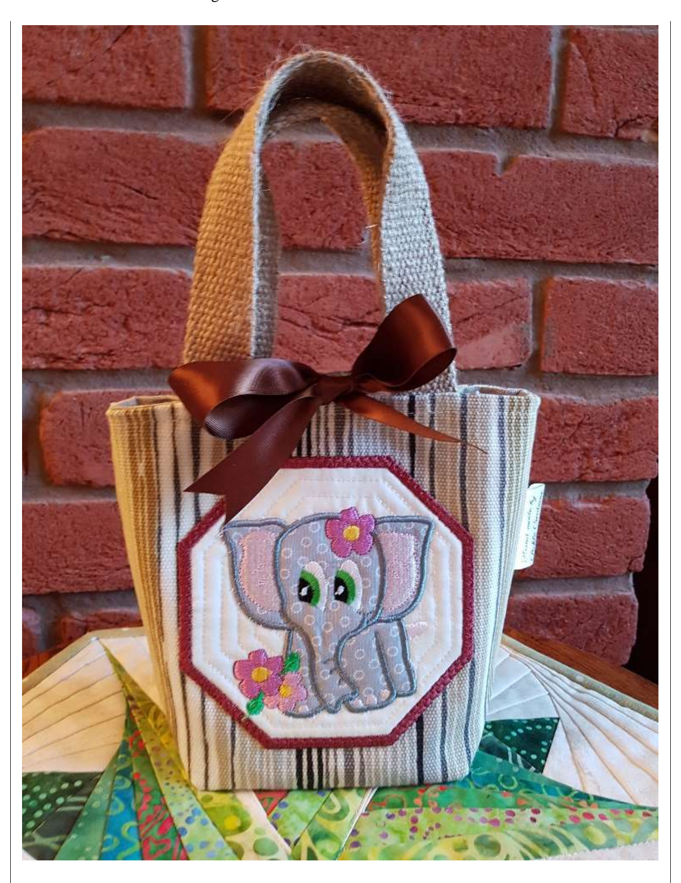
I used the elephant from the Kreative Kiwi design "first friends" collection <a href="https://www.kreativekiwiembroidery.co.nz/product/first-friends.html">https://www.kreativekiwiembroidery.co.nz/product/first-friends.html</a>