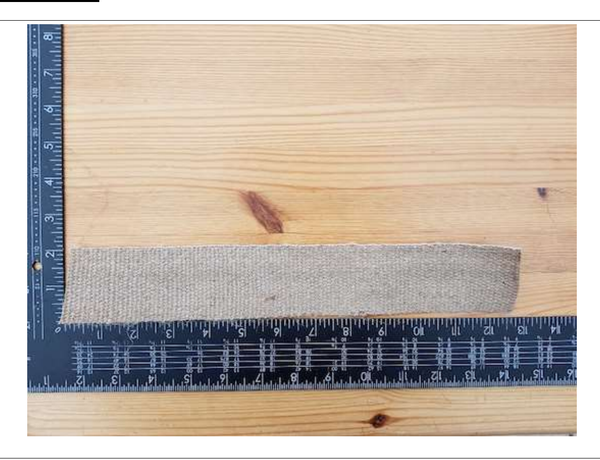
Option A, I used hessian jute webbing, normally used for upholstery. This is 2" wide.