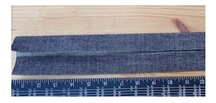
Option B : If you do not have jute webbing.

Using a strip of fabric 12" x 4". Fold lengthways 1" into the centre, then repeat for the other side. Press with an iron, so it looks like the picture above, i.e. 2" wide with two 1" flaps.