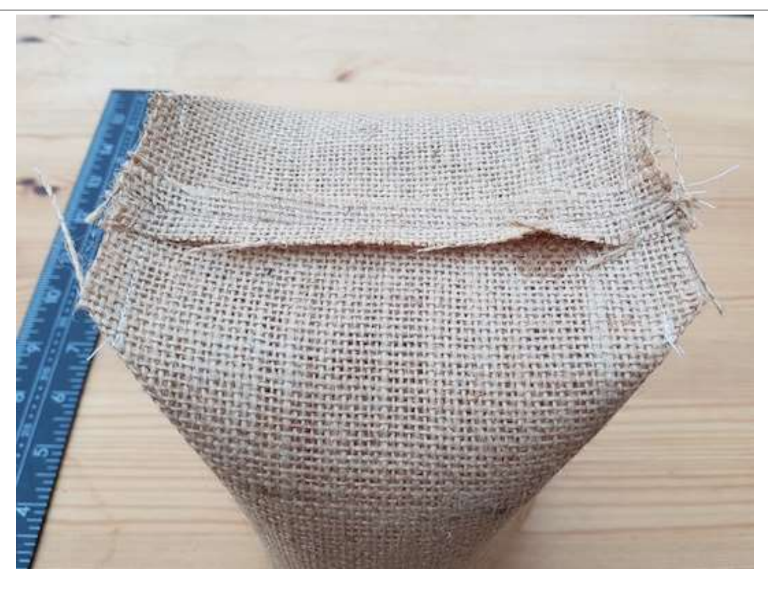
Repeat for the other corner, so it should then look like the picture above.