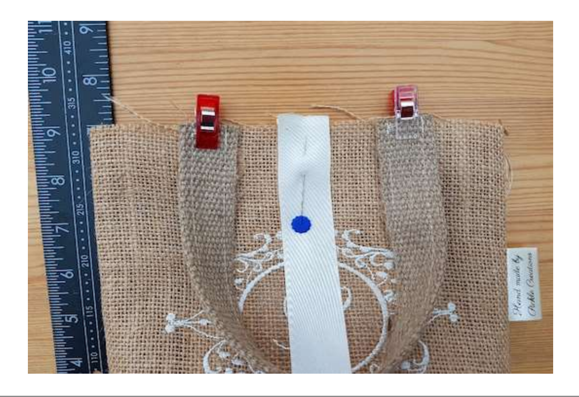
The above shows one side of the bag, with the handle and ribbon pinned / clipped in place.