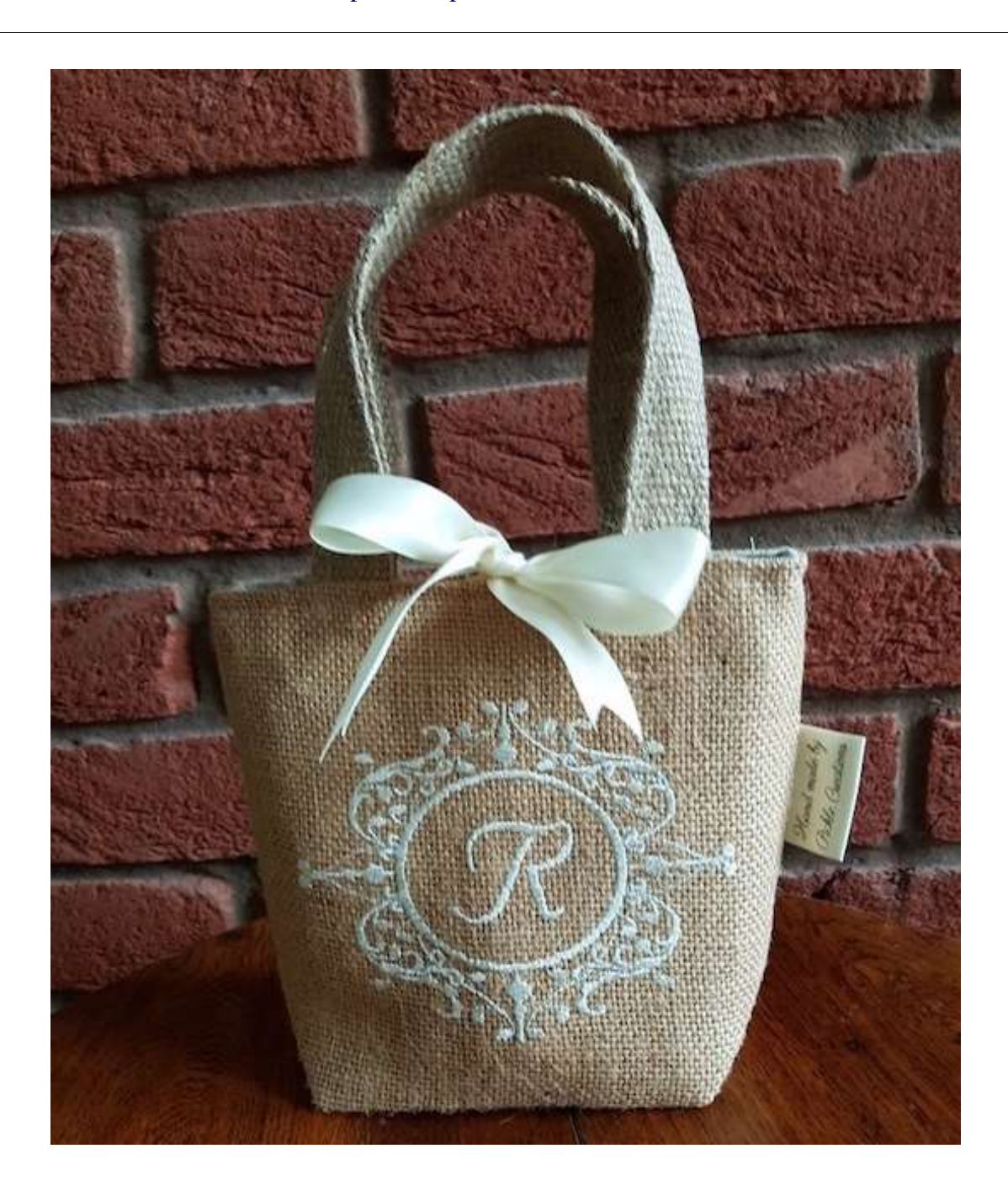
Created by Cathy http://www.picklecreations.co.uk/

<u>Description</u> A relatively simple and quick craft project to produce a small gift bag, that just adds that something special to a gift.