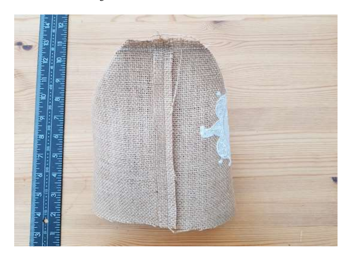
Shown from another angle.