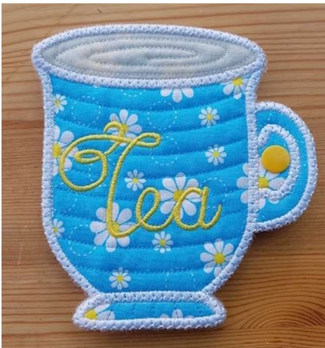
The front of the finished tea bag holder.