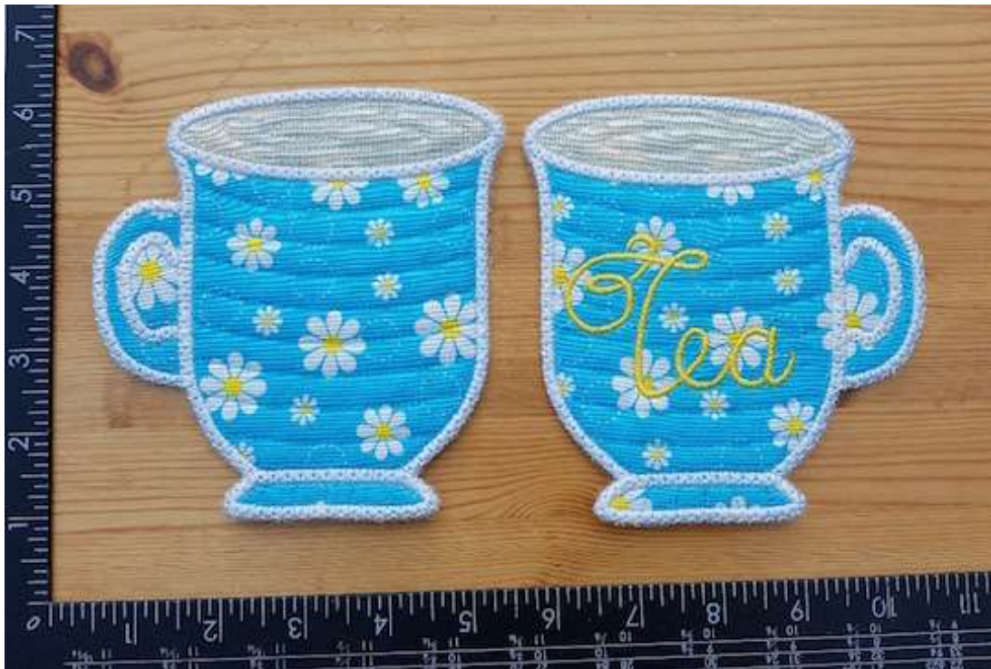
Here we can see the front (with Tea) and back coasters, viewed from the front.