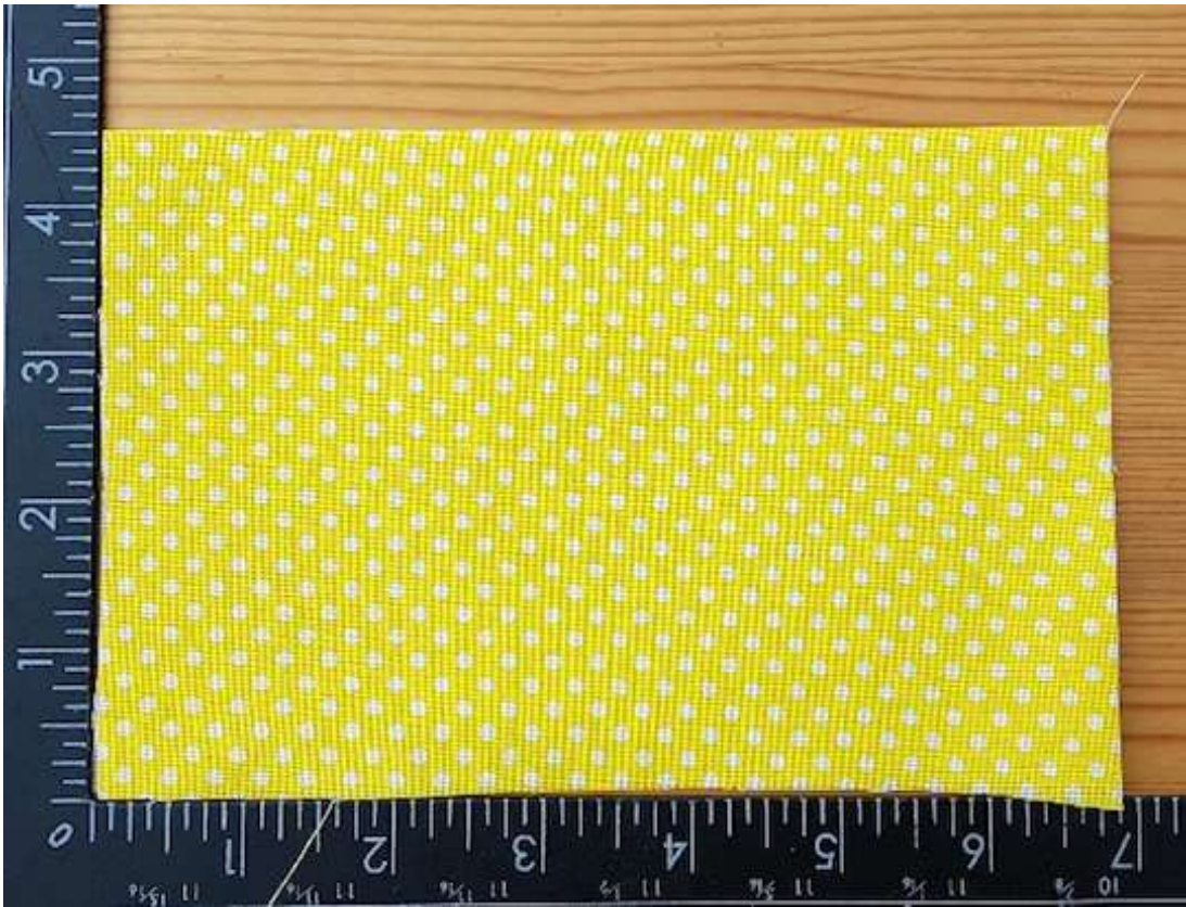
The picture above shows the piece folded in half (fold at the top) to give a tea bag pocket piece of 7" x 4½"