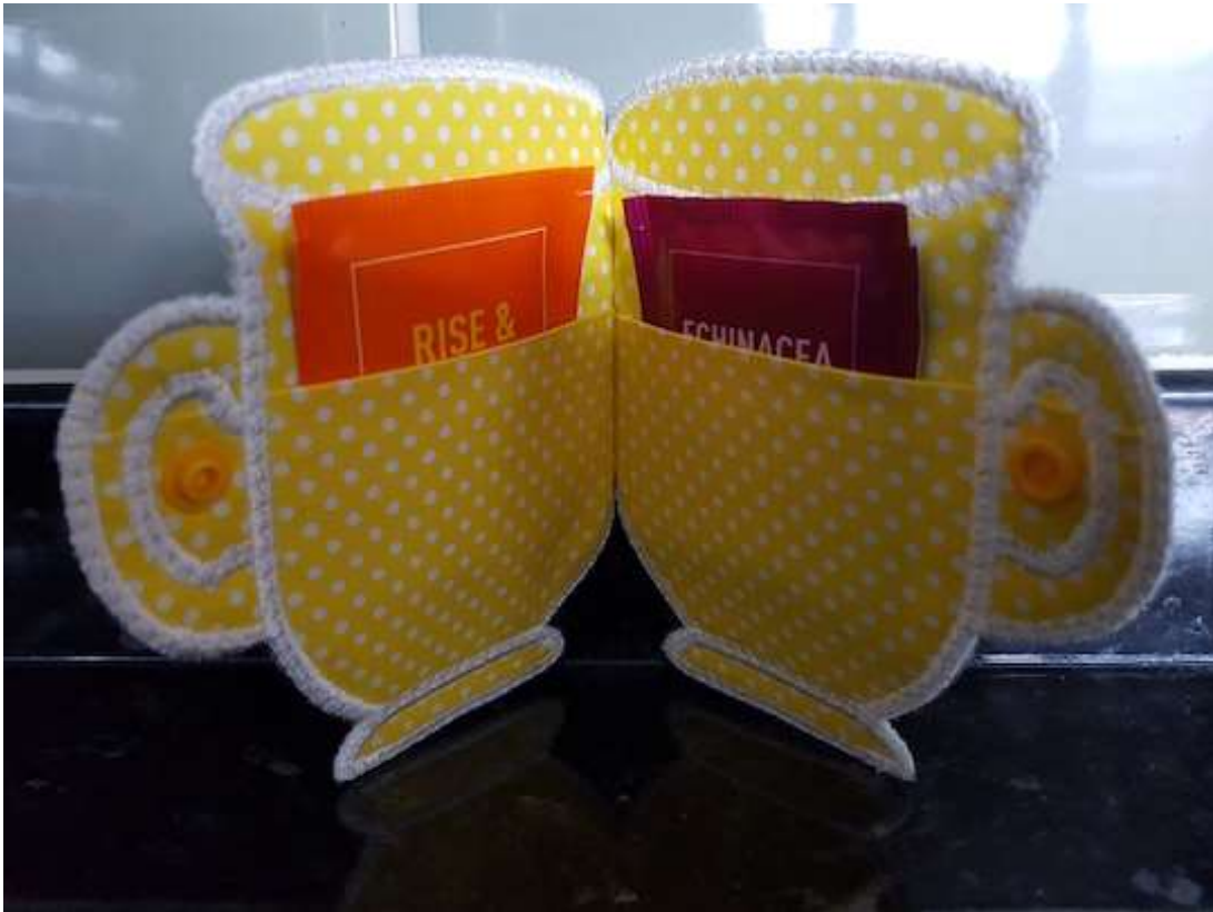
The inside of the finished tea bag holder, that can hold 2 - 4 tea bags,