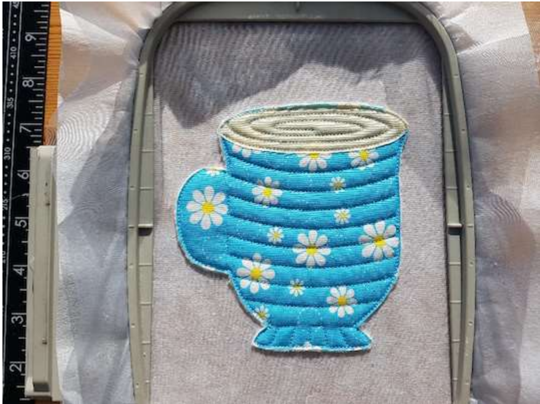
The picture above shows the completed back before adding the backing.