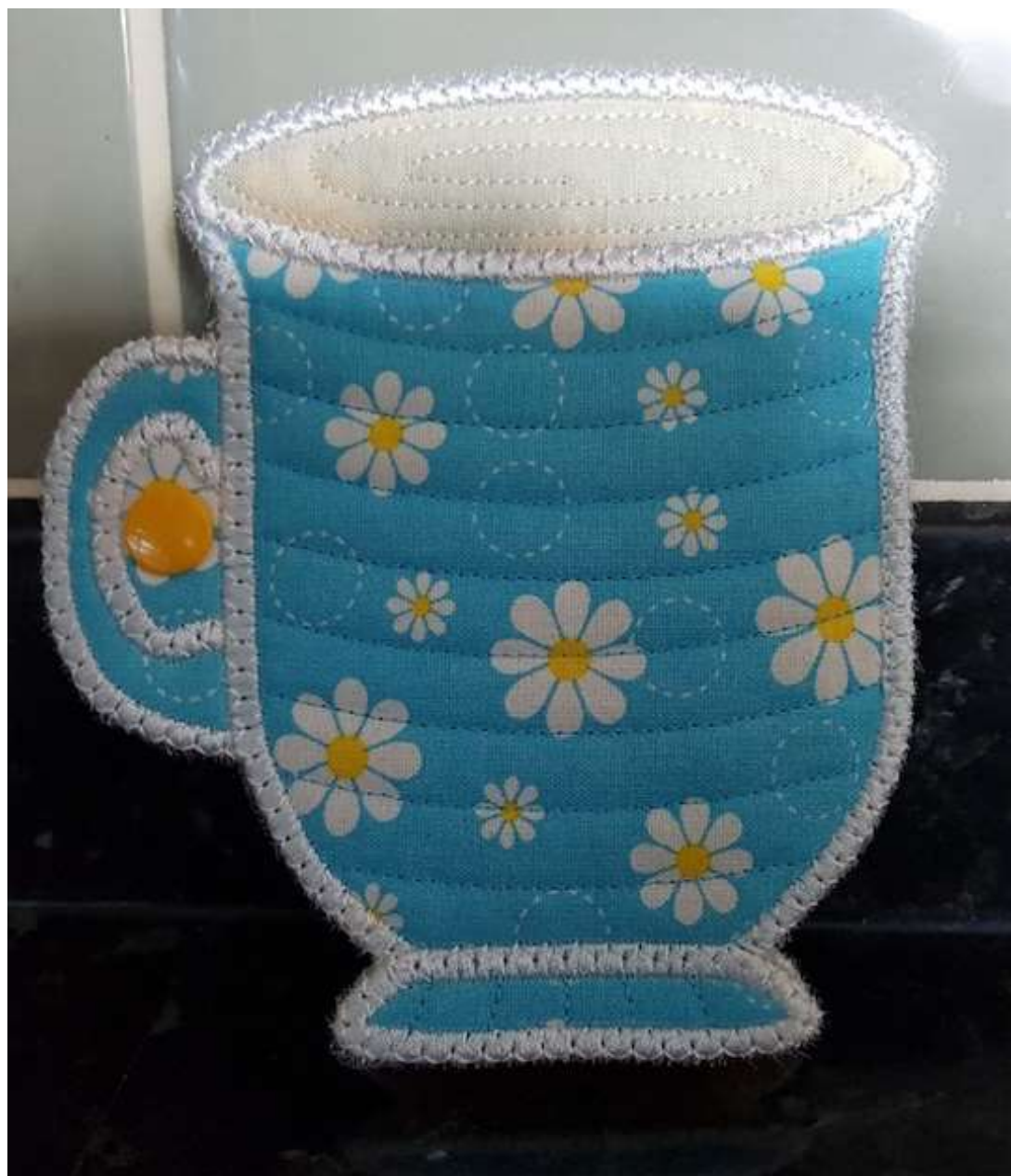
The back of the finished tea bag holder